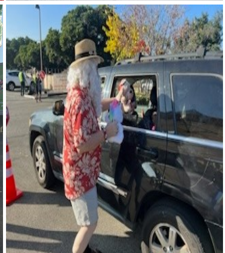
Thank you to everyone who helped to make a very busy 2023 such a blessing for so many people.